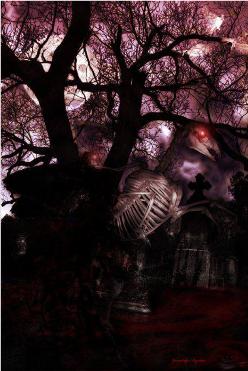
Death Graphic by Gwendolyn Taunton

Obscurist Tradition | Forever wandering into the eternal darkness – a principal accord of the Obscurist. To venture into the great Unknown, that which is the only aspect in merit of truth that can never be defined or justified by any material sensibility of value. It is the essence of being, to confront one Self in true isolation of all vanities, in the depths of ones solitude without any doubt or question. The great charlatans and sorcerers of the ages have all attempted to fabricate a sense of their world through misguided perception by painting or engraving an idealization of the stars up above. And contrariwise, demonized all that persists below and beyond their understanding. But all they have transmuted is but a mere sensory imprint of the imperfect reflection impeded by their limited gnosis. A pursuit of transcendentalism for the Fool who cannot see the All Eventual for all their visionary delusions imminent of their own great Fall. They have all