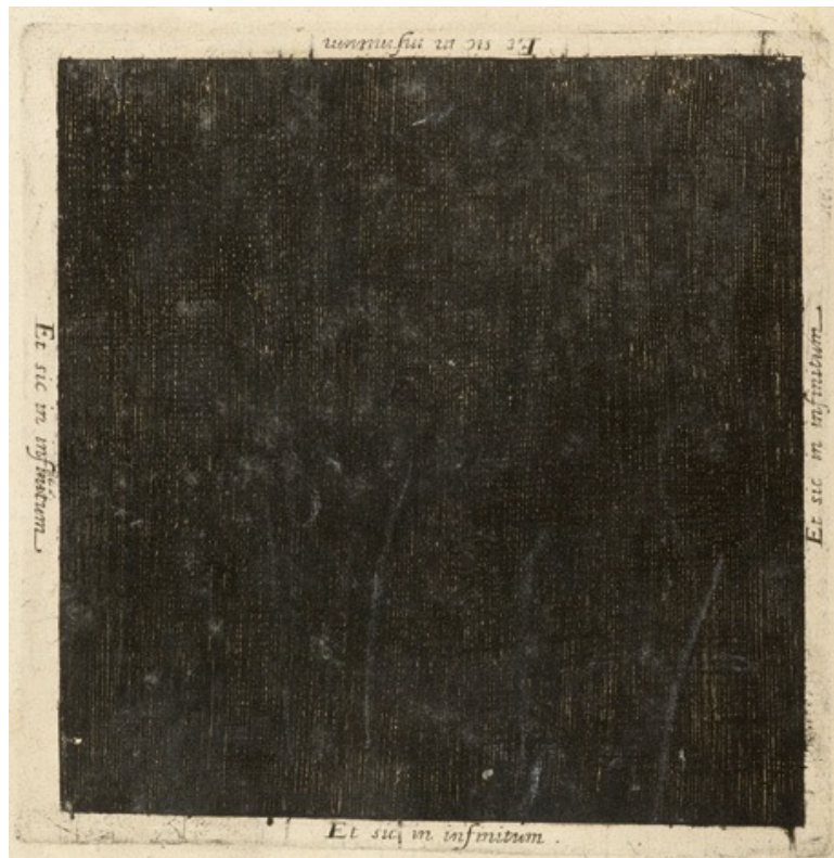
The Nihil by Robert Fludd (1617)

The evidence is in abundance from the Prima Materia (ovule primordia).