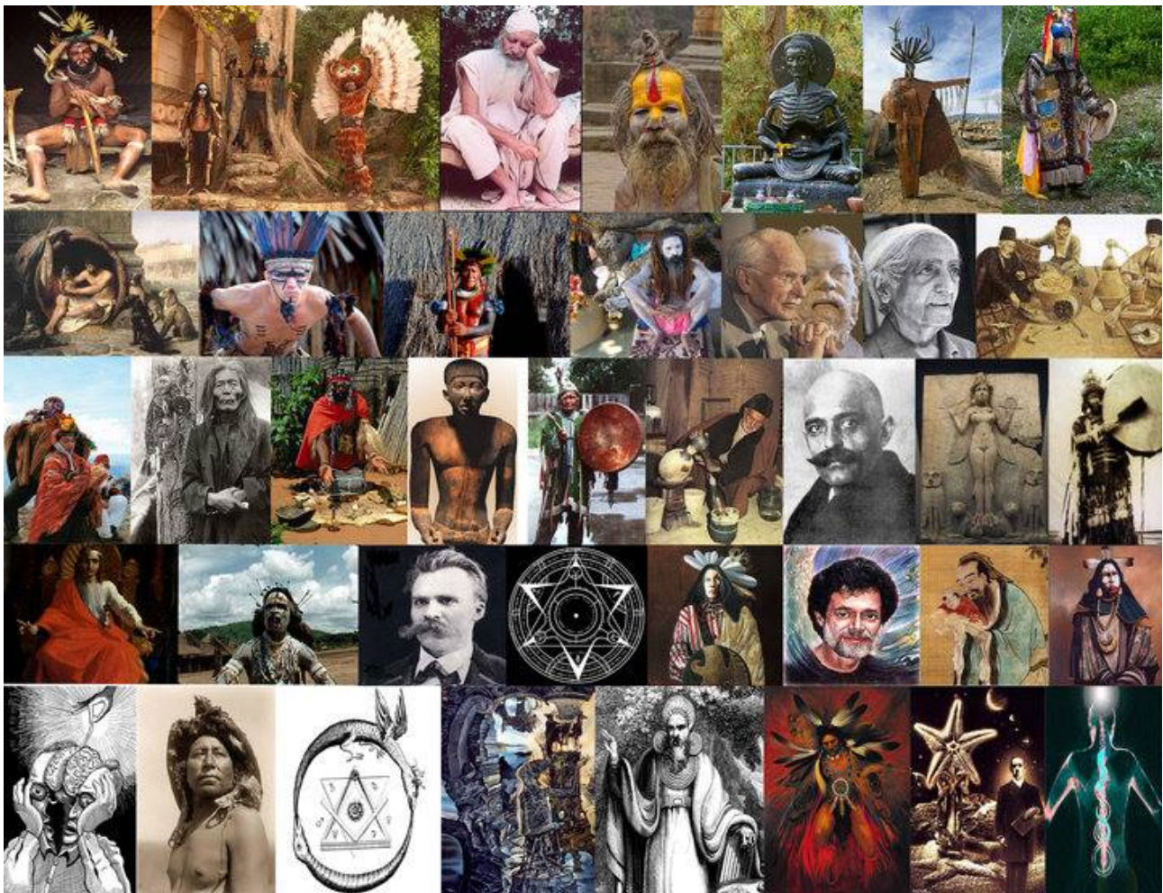
The Obscurist Tradition collage

Classic mythology presents us with a sequence of generations of the gods. This sequence is a scientific account of the history of Culture, and the progress of the astronomical Cycle of Culture. This cosmic cycle will also tell us where on the earth these separate generations of the gods lived and acted out the history of their unique age. This progression of Culture has nothing whatsoever to do with the advance of Civilization. Examination will show that mythology accurately describes the west to east directional flow of the Cycle of Culture here on earth which mimics the Cycle of Galactic Progression in the heavens.” (Thomas Dietrich)