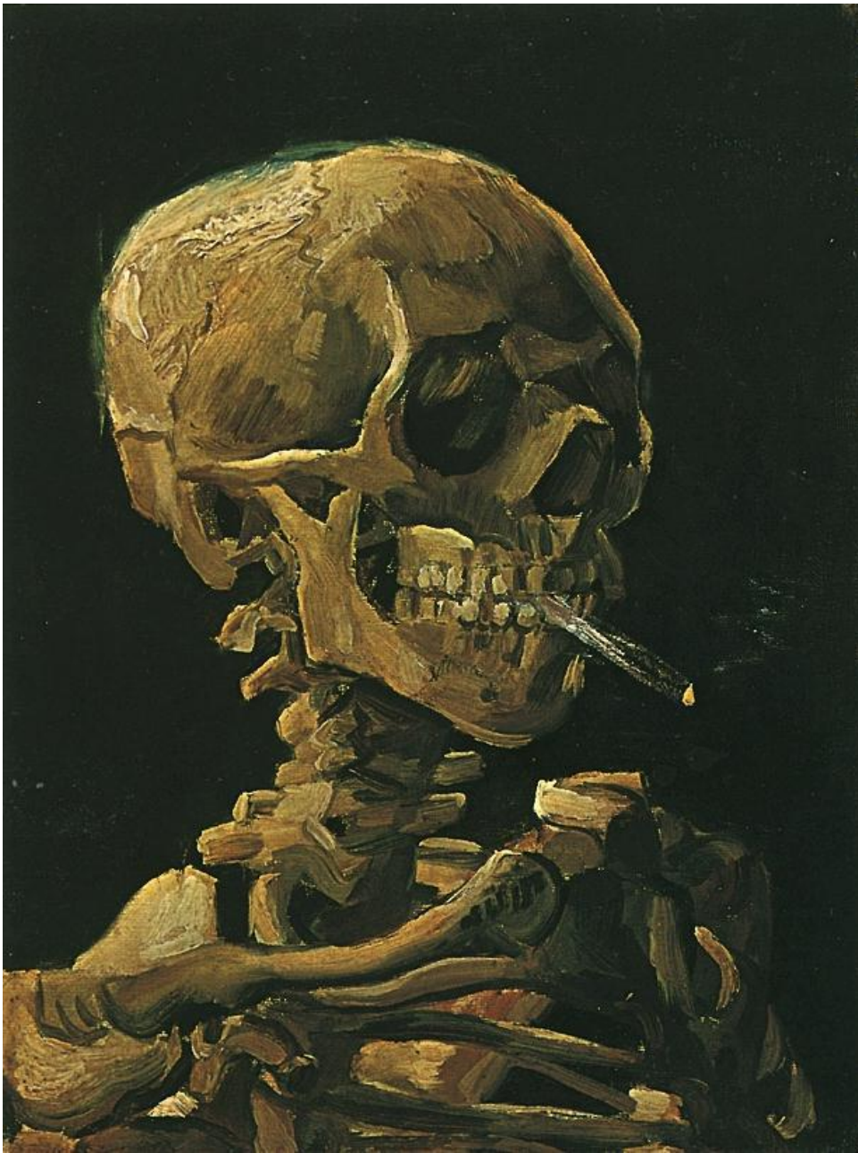
"Skull of a skeleton with burning cigarette" by Vincent Van Gogh

We are the music makers, And we are the dreamers of dreams, Wandering by lone sea-breakers, And sitting by desolate streams;— World-losers and world-forsakers, On whom the pale moon gleams: Yet we are the movers and shakers Of the world for ever, it seems.