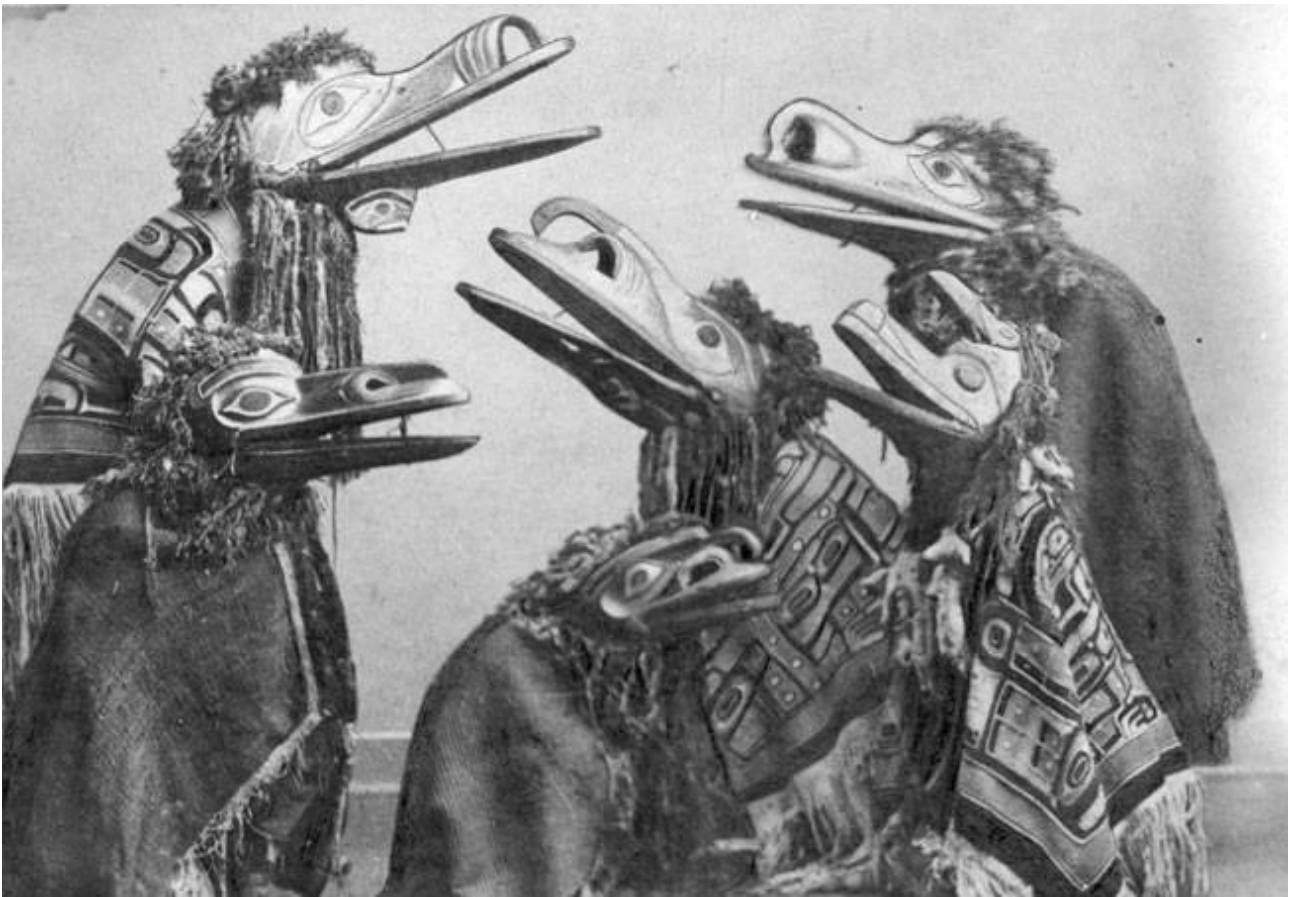
Bella Coola Indians wearing ceremonial blankets and "Crooked Beak of Heaven" masks